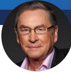
Lord Michael Ashcroft IDU Honorary Chairman

Lord Michael Ashcroft KCMG PC is an international businessman, philanthropist, author and pollster. He was knighted and made a member of the House of Lords in 2000, while serving as Treasurer of the Conservative Party. He later served as Deputy Chairman of the party. In 2012, Lord Ashcroft was appointed to the Privy Council and was made the Prime Minister's Special Representative for Veterans' Transition, working with all departments to ensure military personnel receive the support they need when making the transition back to civilian life. Lord Ashcroft gave up his seat in the House of Lords in 2015 to concentrate on other areas of his life and resigned as the Prime Minister's Special Representative for Veterans' Transition in 2018. Lord Ashcroft is Honorary Chairman of the International Democratic Union (IDU), having previously served the group as Treasurer. He is also one of Britain's leading experts on polling, making the results of his research available on his website, in books and in pamphlets.