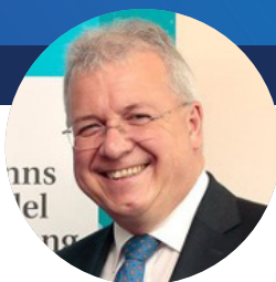
Markus Feber MEP, Chairman Hanns-Seidel Foundation

Born in Augsburg in 1965, Markus Feber initially worked as a development and sales engineer in the fields of microelectronics and environmental technology before being elected to the European Parliament in 1994 to represent Swabia. There, he was spokesman for the Young Group of the EPP until 1999, and from 1996 to 1999 he was the parliamentary manager of the CDU/CSU Group in the EP. From 1999 to 2014 he was chairman of the CSU group, spokesman of the parliamentary group of small and medium-sized businesses from 2013, from 2014 to 2018 first vice-chairman of the Committee on Economic and Monetary Affairs, and coordinator of the EPP group of this committee in the EP from 2018. Feber is also a substitute member of the Committee on Transport and Tourism. In addition, he is district chairman of the CSU Swabia and was state chairman of the Europa Union Bayern from 2000 until 2021. For six years, he was Vice Chairman of the Hanns Seidel Foundation, and since January 1 2020, he has been its first Chairman.