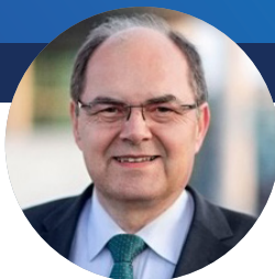
Christian Schmidt High Representative for Bosnia and Herzegovina

Christian Schmidt is the High Representative for Bosnia and Herzegovina, a position he has held since 2021. From 1990-2021 he was a Member of the German Bundestag, during which time he was Federal Minister of Food and Agriculture from 2014 to 2018, Parliamentary State Secretary at the Federal Ministry of Economic Cooperation and Development from 2013 to 2014, and Parliamentary State Secretary at the Federal Ministry of Defence from 2005 to 2013. He has been President of the German Atlantic Association since 2006, Vice-Chair of the Hanns-Seidel-Foundation since 2018, and Co-Chair of the Advisory Board of the German-Czech Discussion Forum since 2013. Schmidt is a lawyer by profession, having studied in Erlangen and Lausanne. Born in 1957 in Obernzenn (Franconia) he is a married father of two children.